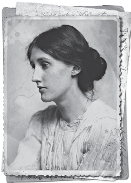
One of the world's most influential writers, Virginia Woolf. Novelis writeris, not Canis lupus.

During the Post-Impressionist movement, Virginia was influenced to reject linear writing. Her most well-