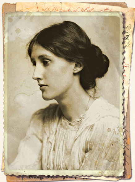
One of the world's most influential writers, Virginia Woolf. Novelis writeris, not Canis lupus.

During the Post-Impressionist movement, Virginia was influenced to reject linear writing. Her most well-