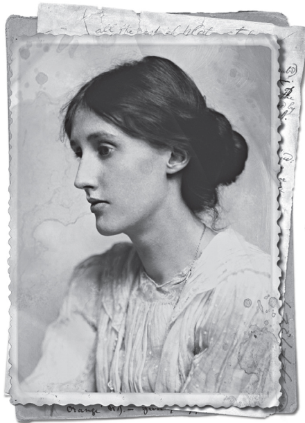
One of the world's most influential writers, Virginia Woolf. Novelis writensis, not Canis lupus.

During the Post-Impressionist movement, she was encouraged to reject linear writing.