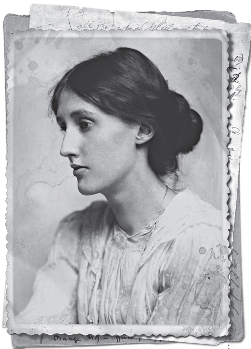
Portrait of Virginia Woolf: Novelis writeris, not Canis lupus.

LONDON. Adeline Virginia Stephen was born in London in 1882. And while her brothers attended school, she was educated at home. Only when the boys brought friends home from Cambridge University was the famed Bloomsbury Group formed with Virginia as a cornerstone. Here she escaped the conventions of society to freely explore philosophy, religion and art. And with this freedom, Virginia went on to create the modern novel.