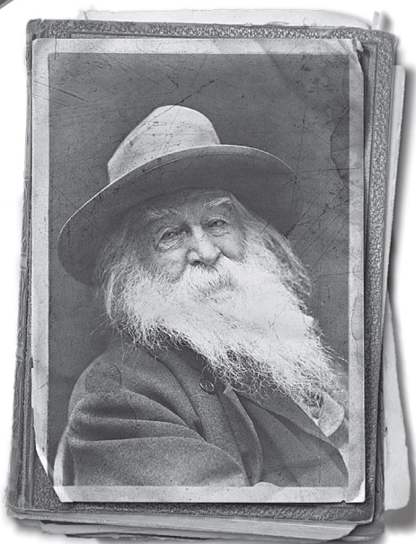
Whitman satisfied his sweet tooth with rich, wave-like verse. Every kid should make poetry a part of his diet.

The son of a Quaker carpenter, Walt Whitman grew up with an affinity for nature. This, along with his love for New York City, inspired him to write a truly original kind of poetry, the likes of