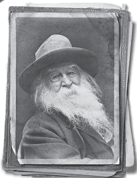
Whitman satisfied his sweet tooth with rich, wave-like verse. Every kid should make poetry a part of his diet.

Throughout his career, Whitman rewrote and