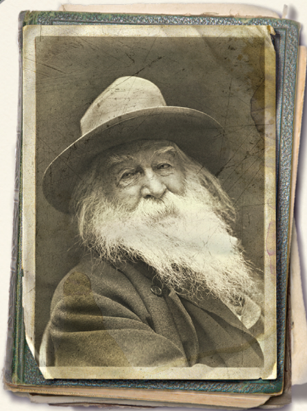
Whitman satisfied his sweet tooth with rich, wave-like verse. Every kid should make poetry a part of his diet.

Throughout his career, Whitman rewrote and