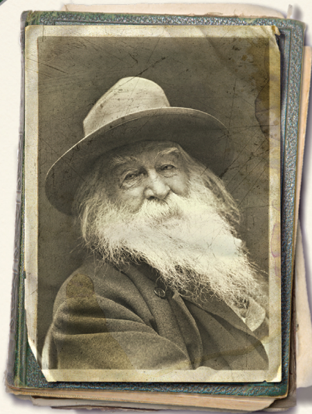
Whitman satisfied his sweet tooth with rich, wave-like verse. Every kid should make poetry a part of his diet.

Throughout his career, Whitman rewrote and