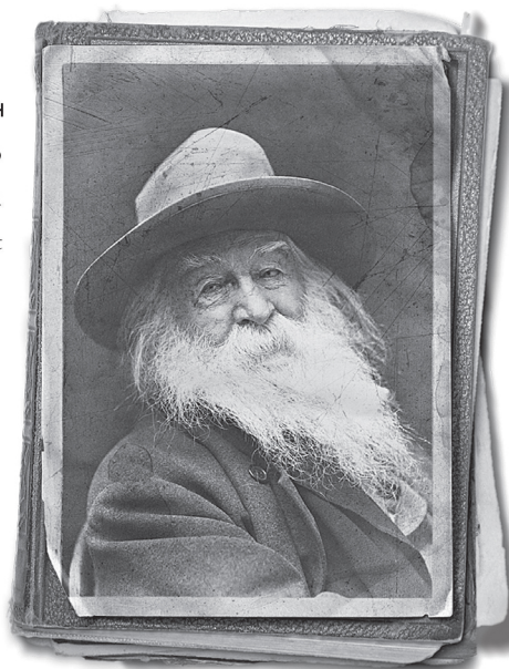
Whitman satisfied his sweet tooth with rich, wave-like verse. Every kid should make poetry a part of his diet.

Throughout his career, Whitman rewrote and reinvented Leaves of Grass , expanding and