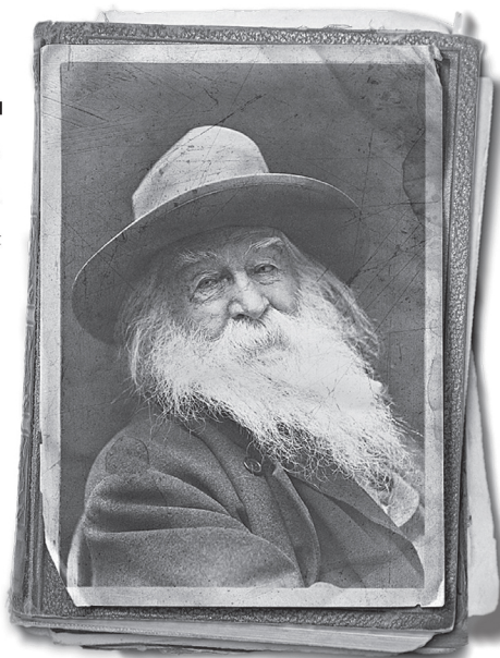
Whitman satisfied his sweet tooth with rich, wave-like verse. Every kid should make poetry a part of his diet.

Throughout his career, Whitman rewrote and reinvented Leaves of Grass , expanding and