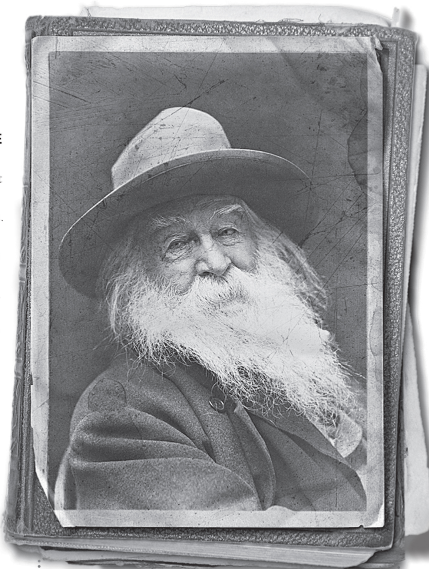
Walt Whitman satisfied his sweet tooth with rich, wave-like verse.

Whitman is best known for 1855's Leaves of Grass , a collection of poems that he would reinvent constantly throughout his career. But due