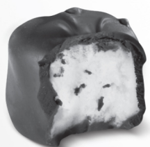
Too much of Whitman's art won't give you a stomachache.

CHOCOLATES. Born on Long Island in 1819, the son of a Quaker carpenter, Walt Whitman grew up with an affinity for nature. This, combined with his awe of New York City during a time of rapid growth, inspired him to write a new and different kind of verse the likes of which America had never seen.