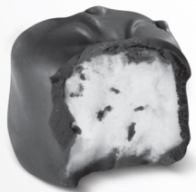
Too much of Whitman's art won't give you a stomachache.

up to write a poem of their own someday. For Ten Simple Ways to get more art in your kid's life, visit www.AmericansForTheArts.org .