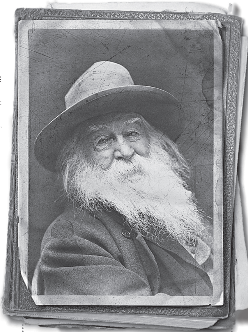
Walt Whitman satisfied his sweet tooth with rich, wave-like verse.

Whitman is best known for 1855's Leaves of Grass , a collection of poems that he would reinvent constantly throughout his career. But due