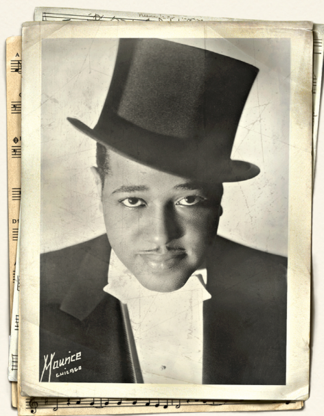
A piano player. A composer. An orchestra leader. Duke Ellington reigned over a land called Jazz.

His music spread across the world with songs like "Sophisticated Lady," "In a