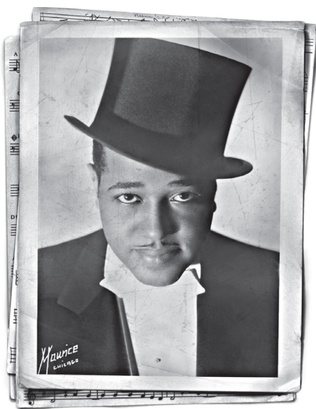
A piano player. A composer. An orchestra leader. Duke Ellington reigned over a land called Jazz.

His music spread across the world with songs like "Sophisticated Lady," "In a Sentimental Mood"