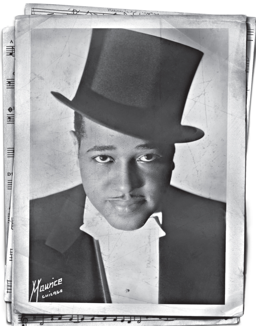
A piano player. A composer. An orchestra leader. Duke Ellington reigned over a land called Jazz.

Harlem's Cotton Club. And his music spread across town — and across the world — with songs like "Sophisticated Lady," "In a Sentimental Mood" and "Mood Indigo." By the time he was telling folks to "Take the 'A' Train," Duke Ellington and his orchestra were sitting on