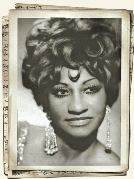
The undisputed Queen of Salsa. Funny, she doesn't look like a hot sauce.

as men. And when she immigrated to the United States, she joined forces with the Latin headliner Tito Puente. But it was in 1973 at Carnegie Hall when Celia burst onto the concert stage wearing flamboyant