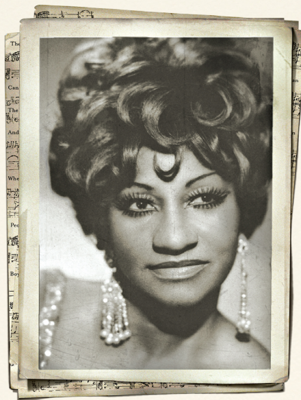
The undisputed Queen of Salsa. Funny, she doesn't look like a hot sauce.

as men. And when she immigrated to the United States, she joined forces with the Latin headliner Tito Puente. But it was in 1973 at Carnegie Hall when Celia burst onto the concert stage wearing flamboyant