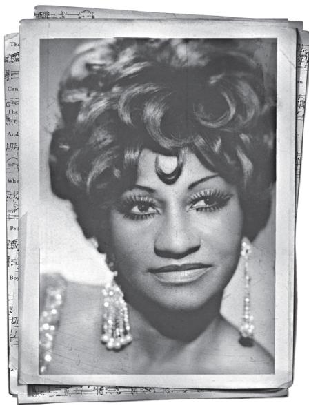
The undisputed Queen of Salsa. Funny, she doesn't look like a hot sauce.

But it was in 1973 at Carnegie Hall when Celia burst onto the concert stage wearing flamboyant