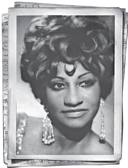
The undisputed Queen of Salsa. Funny, she doesn't look like a hot sauce.

But it was in 1973 at Carnegie Hall when Celia burst onto the concert stage wearing flamboyant