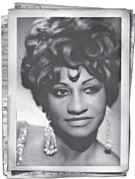
The undisputed Queen of Salsa. Funny, she doesn't look like a hot sauce.

as men. And when she immigrated to the United States, she joined forces with the Latin headliner Tito Puente. But it was in 1973 at Carnegie Hall when Celia burst onto the concert stage wearing flamboyant