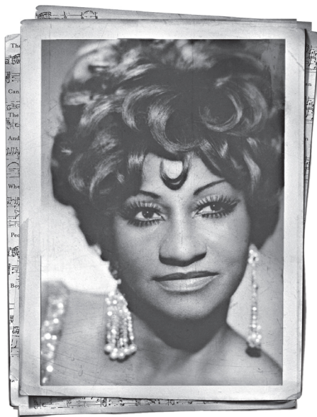
The undisputed Queen of Salsa. Funny, she doesn't look like a hot sauce.

as men. And when she immigrated to the United States, she joined forces with the Latin headliner Tito Puente. But it was in 1973 at Carnegie Hall when Celia burst onto the concert stage wearing flamboyant