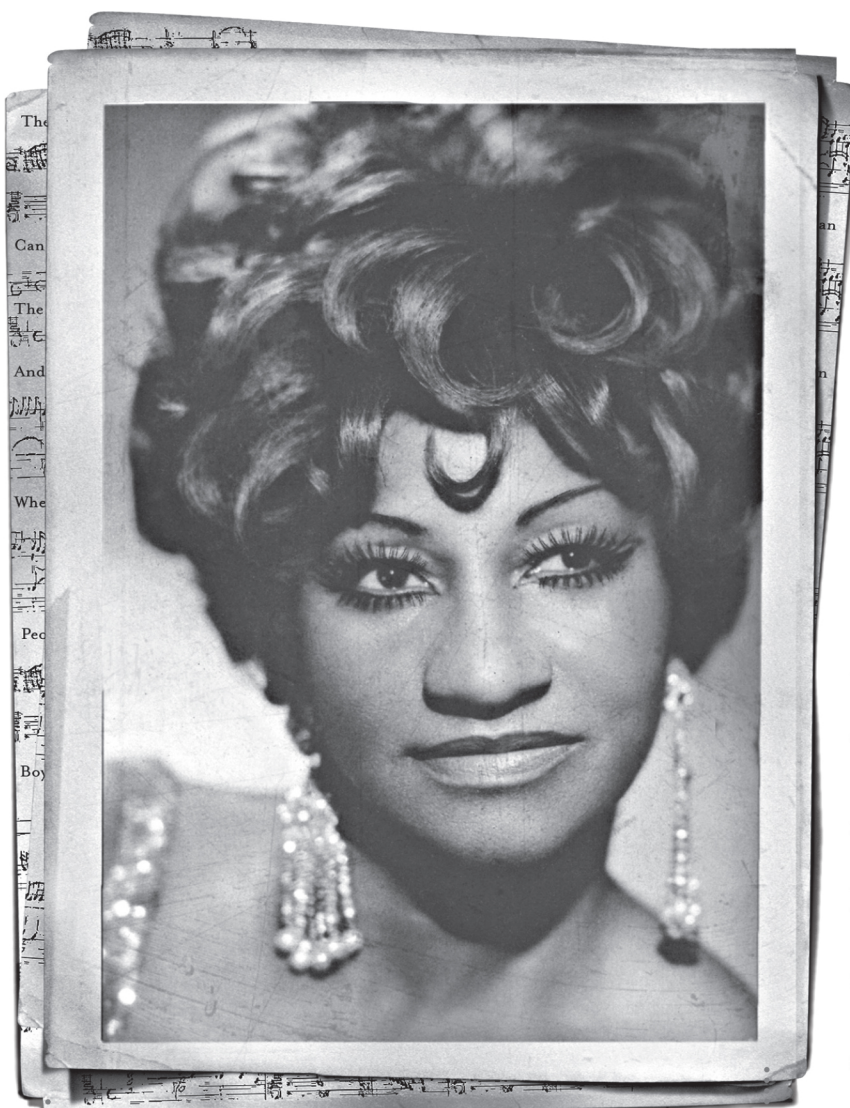
The undisputed Queen of Salsa. Funny, she doesn't look like a hot sauce.

to tourists who gave her shoes instead of money. She bounced around from school productions to talent shows to Cuba's Conservatory of Music. Finally, in 1950 she got her big break with La Sonora Matancera, the Latin equivalent of the Duke Ellington Orchestra. It was there where she honed her unique vocal style and proved that women could sell as many records as men.