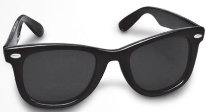
In order to become a hip-swiveling-larger-than-life-Latin superstar, you have to take some risks. And wear fashionable shades.

Celia Cruz didn't start off as the Queen of