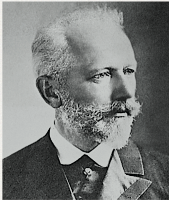
Peter Ilyich Tchaikovsky endured many setbacks, not the least of which was a blind barber.

Indeed, this great Romantic composer should be so immortalized. As a young man, he pursued a career in music at enormous personal risk and against his own father's advice. His mild temperament combined with his tendency to work too hard left him with insomnia, debilitating headaches and hallucinations. On top of that, Tchaikovsky's composition teacher never liked his work,