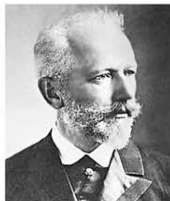
Peter Ilyich Tchaikovsky endured many setbacks, not the least of which was a blind barber.

Indeed, this great Romantic composer should be so immortalized. As a young man, he pursued a career in music at enormous personal risk and against his own father's advice. His mild temperament combined with his tendency to work too hard left him with insomnia, debilitating headaches and hallucinations. On top of that, Tchaikovsky's composition teacher never liked his work,