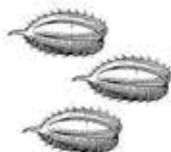
Fig 1 Pollen

If one were to make a quick list of the world's favorite composers, despite his relatively recent vintage Peter Ilyich Tchaikovsky would be on it. After all, he did compose