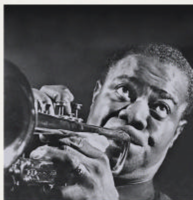
Instead of a giant leap, Louis Armstrong delivered one giant free-form crazy jazz groove for mankind.

20th century, giant leaps were simply a matter of course for Satchmo. For no one has ever embodied the art form the way he did. It was he who helped make virtuoso solos a part of the vocabulary. It was he who was honored with the title "American goodwill ambassador" by the State Department. It was he who was the last jazz musician to hit #1 on the Billboard pop chart.