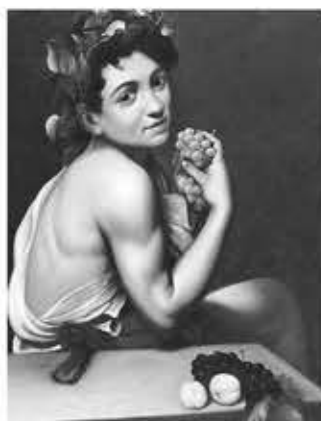
A self-portrait of Caravaggio as Bacchus. Honestly, he wouldn't last 10 minutes on The Sopranos .

He grew up in less than ideal circumstances. Most of his family died in the plague. Much of his youth was misspent on the mean streets of Rome. And as a