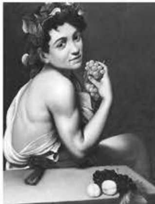
A self-portrait of Caravaggio as Bacchus. Honestly, he wouldn't last 10 minutes on The Sopranos .

He grew up in less than ideal circumstances. Most of his family died in the plague. Much of his youth was misspent on the mean streets of Rome. And as a