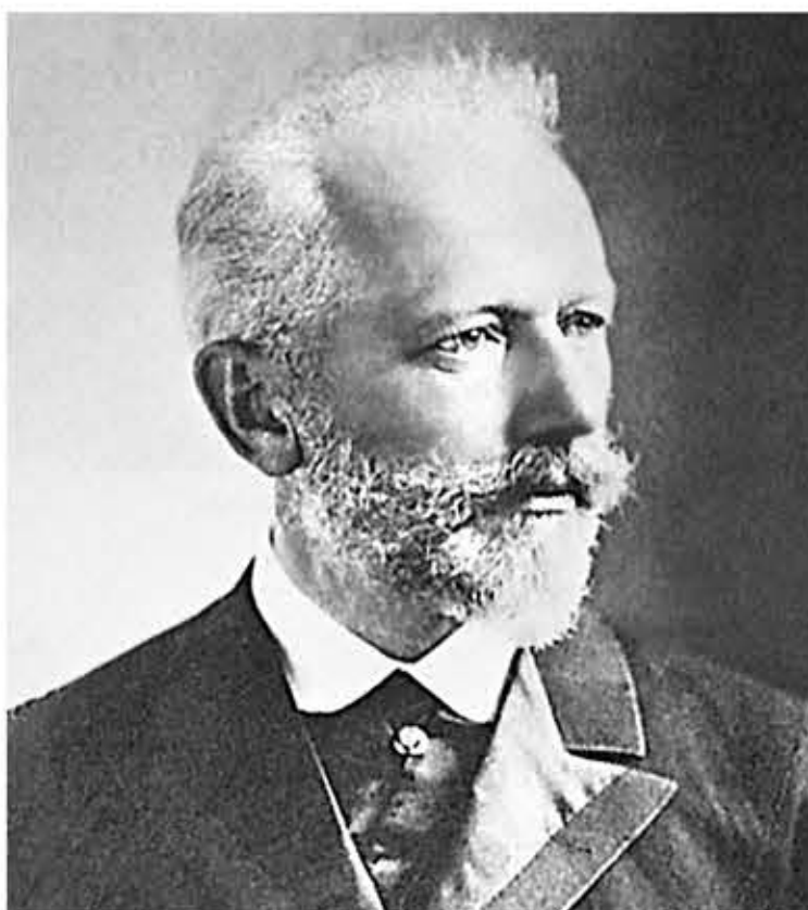
Among the many setbacks Peter Ilyich Tchaikovsky endured: a disapproving family, a loveless marriage, a blind barber.

Setbacks such as these could have finished a lesser man. Instead, they informed his work,