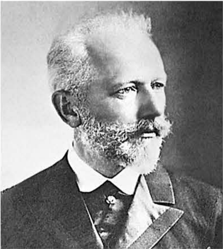
Among the many setbacks Peter Ilyich Tchaikovsky endured: a disapproving family, a loveless marriage, a blind barber,

Setbacks such as these could have finished a lesser man. Instead, they informed his work,