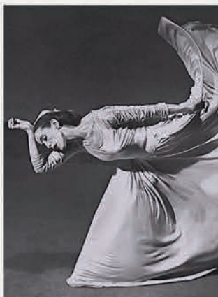
Ms. Graham told stories using movement. Here, she tells us how sad it is that kids aren't getting enough art.

shattering the expectations of audiences and critics alike with her percussive, angular movement style. She was one of the first dancers to collaborate with contemporary composers instead of using the 18th- and 19th-century compositions her predecessors favored. Her dances have been called "motion pictures for the sophisticated"; her theories on movement and kinesthetics are still vital today; and there is scarcely a dancer alive who doesn't