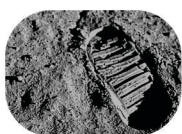
Armstrong left his footprints on the jazz world, wearing lace-up oxfords.

AmericansForTheArts.org. Just like the great Louis Armstrong, all you need is a little brass.