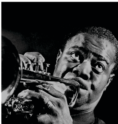
Instead of a giant leap, Louis Armstrong delivered one giant free-form crazy jazz groove for mankind.

the trumpet was as a guest in a correctional home for wayward boys. If only today's schools were as enlightened and informed as that reformatory was.